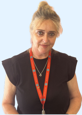
Child Wellbeing Support Officer