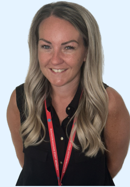
Family Engagement Officer